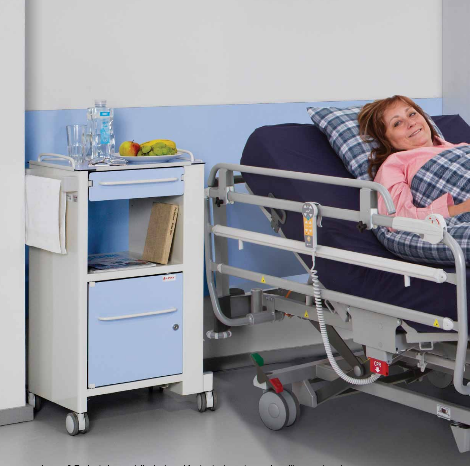
Image 3 Bariatric is specially designed for bariatric patients who will appreciate the comfort, safety and practicality of this bed meeting the highest standards. The main priorities include safe working load of 320 kg. Image 3 facilitates daily routine activities for medical staff, as well as patients, helping them feel as comfortable as possible. Thanks to its versatility the bed offers a wide range of utilization options for healthcare facilities. Simple, intuitive operation, lever construction, low height or brake alarm are just some of the few features of this bed.