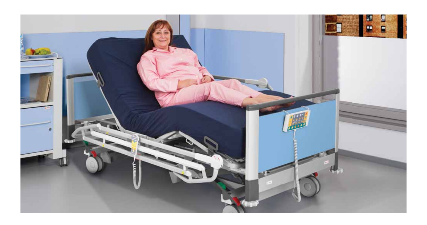
IMAGE 3 | electrically adjustable Bariatric bed contains extended features which pressure ulcers and contribute to their easier treatment. Mattress platform profiling called Ergoframe® provides needed comfort for patient. Integral part of the antidecubites measure on the bed is also the range of active mattresses developed and manufactured by Linet.