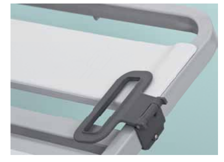
FOLDABLE MATTRESS RETAINERS allows to adjust for different mattress width.