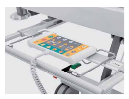
DESIGN LINEN HOLDER could be easily used as a storage for Supervisory control panel.